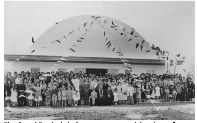
The Grand Festivals in Sacramento are celebrations of appreciation and joy that strengthen relationships among members. The member-built main hall (shown above) was dedicated in April 1952, coinciding with Spring Festival.

There is no difference as far as the sacred spiritual atmosphere of the Holy Grounds, which welcomes everyone equally. However, there is a vast difference in the amount of virtue each worshipper's mind is capable of receiving. In the final analysis, the sacred spiritual power deeply penetrates the hearts of those worshippers who believe in paying homage with good grace, abiding from their original intentions to the last.