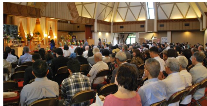
Worshippers express their prayers of appreciation in the Gochi Sanctuary during the Spring and Fall Grand Festivals.

This is because, in rendering free services at the Holy Grounds, you are not only serving God, but you are engaged in purifying your own soul. Therefore, when you visit the Grounds, your primary intention must be to express gratitude for being given the chance to visit.