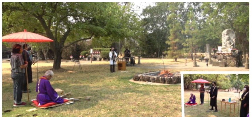
Top photo: Fall foliage on the Holy Grounds of the Gedatsu Spiritual Center.

All regularly scheduled in-person services and activities are suspended until further notice. Ministers are always available to support members by phone, videoconferencing and other means for private consultations, family blessings and memorial services. Contact your local church for further information.