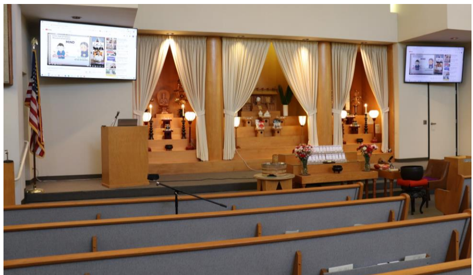
The new 85-inch flat-screen display monitor, above left, and the older, smaller screen on the right, flank the sanctuary altar. Together, they enhance the congregation's viewing of information and graphics.

NON-PROFIT ORGANIZATION U.S. POSTAGE PAID ONTARIO, CA PERMIT NO. 574