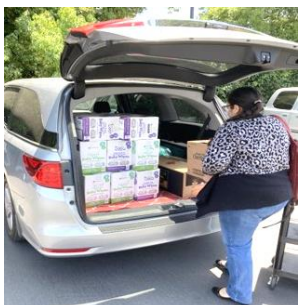
Guadalupe Pregnancy Services