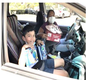
Migrant Education Program