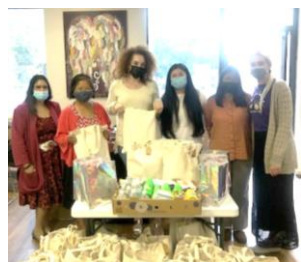
My Sister's House