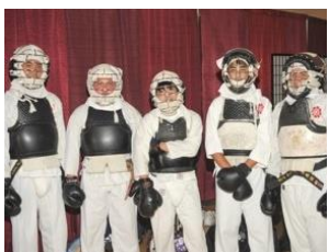
iForce Dojos – AIJO Nippon Kenpo Foundation