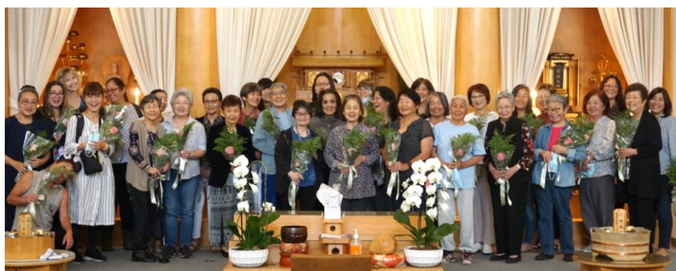
Honored mothers and ladies at the L.A. Church Mother's Day celebration.

The L.A. Church welcomed members and friends to its Mother's Day service and lunch. Moms and ladies were honored with gifts of roses and ceramic mugs like the one below, specially designed by children as a Sunday School project. The joyful celebration included a ukulele musical performance and Nijiya-prepared bento lunches.