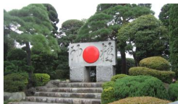
Sun Spirit Service

Changes to the schedule will be announced by the church and published in the Gedatsu Companion and other communications.