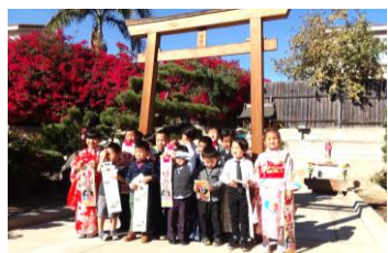
7-5-3 Children's Celebration

Jan 1 (Sun) Jan 15 (Sun) Jan 17 (Tue) Jan 22 (Sun)