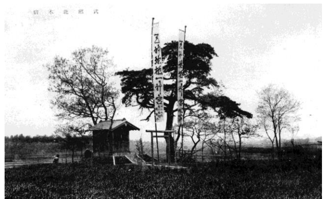
Goreichi in its earliest years